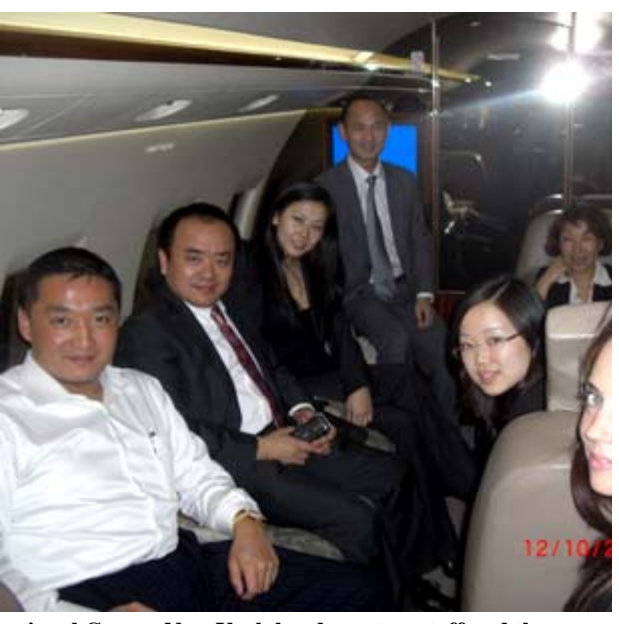
New York International Group, New York headquarters staff and the mana